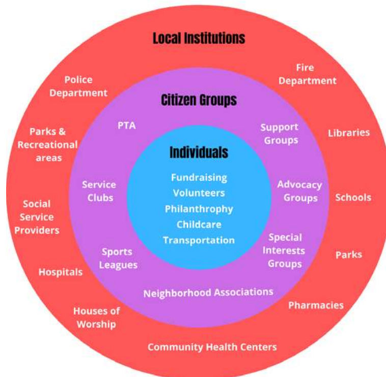
Concentric Circle Asset Model