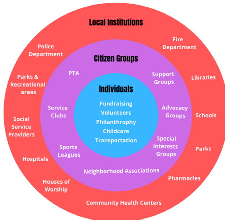
Concentric Circle Asset Model